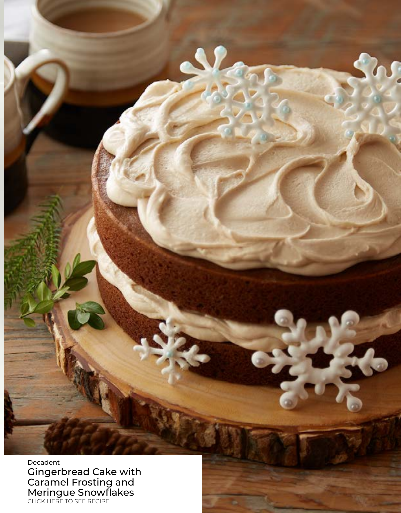
Decadent Gingerbread Cake with Caramel Frosting and Meringue Snowflakes CLICK HERE TO SEE RECIPE