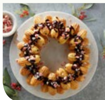
Festive Peppermint Chocolate Éclair Wreath CLICK HERE TO SEE RECIPE